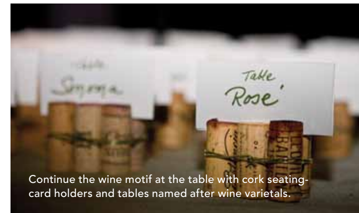
Continue the wine motif at the table with cork seating-card holders and tables named after wine varietals.

No celebration is complete without music. "A winery offers the perfect backdrop for a classical string ensemble to play during the ceremony and cocktail hour," says Montero. At the reception, groove to a fun bluegrass, folk or country band.