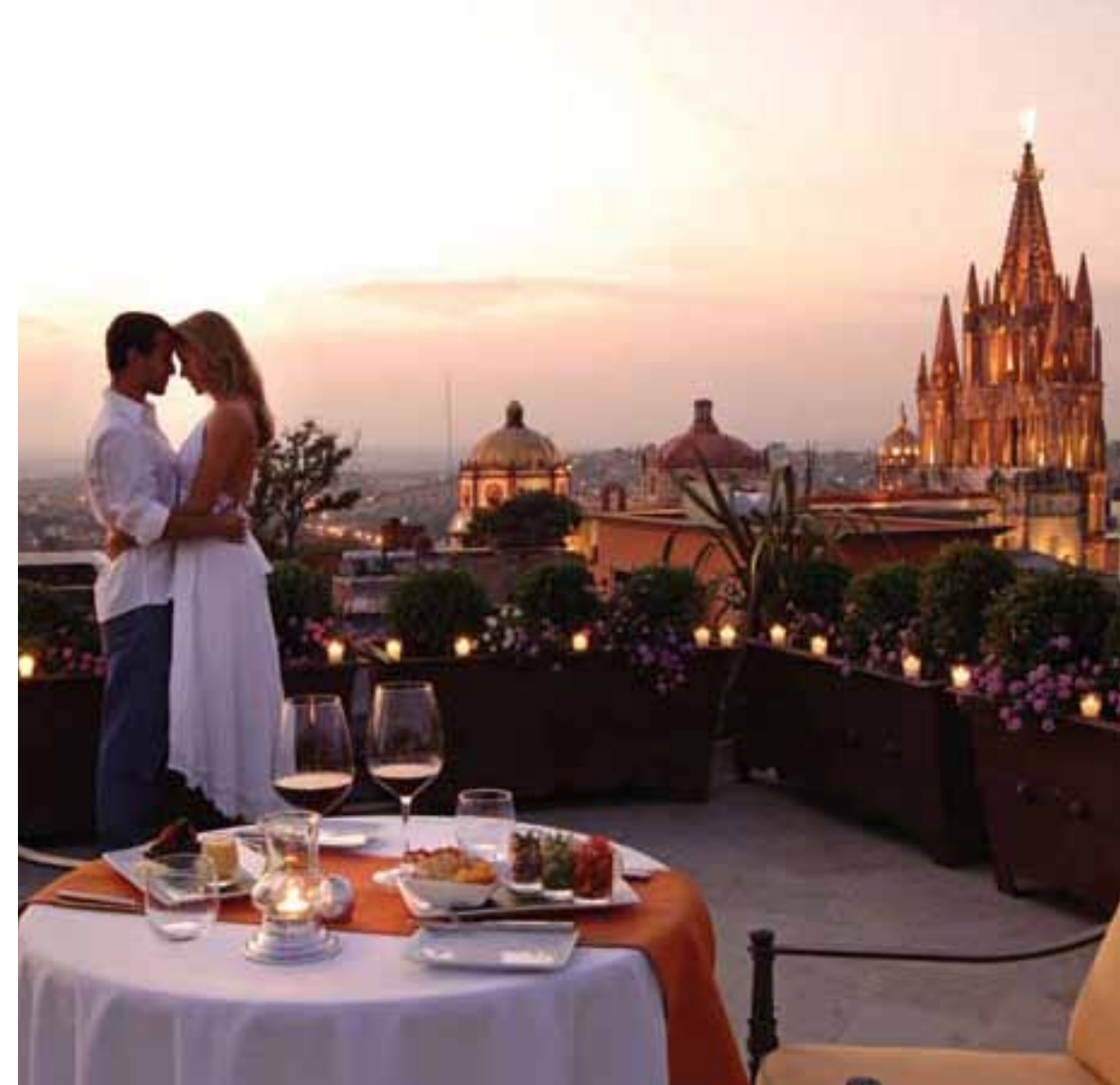
Mexico provides many magical spots to tie the knot. The breathtaking views from this romantic rooftop locale in San Miguel are unforgettable. Left: Margaritas get the party rolling.

perity in times to come. The groom and groomsmen can wear guayabera shirts or suits with silver embroideries, while the ring bearer and flower girls may don traditional Mexican outfits, Light suggests.