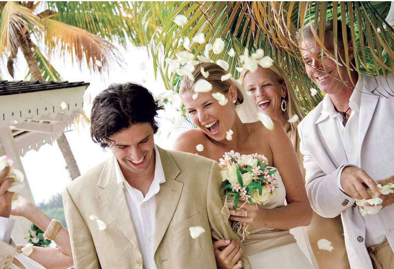
For ceremonies in the Caribbean, couples don't have to look far for inspiration. The sea, sand and palm trees create a beautiful backdrop for weddings with an island vibe. Right: Steel drums set the mood for a festive reception.